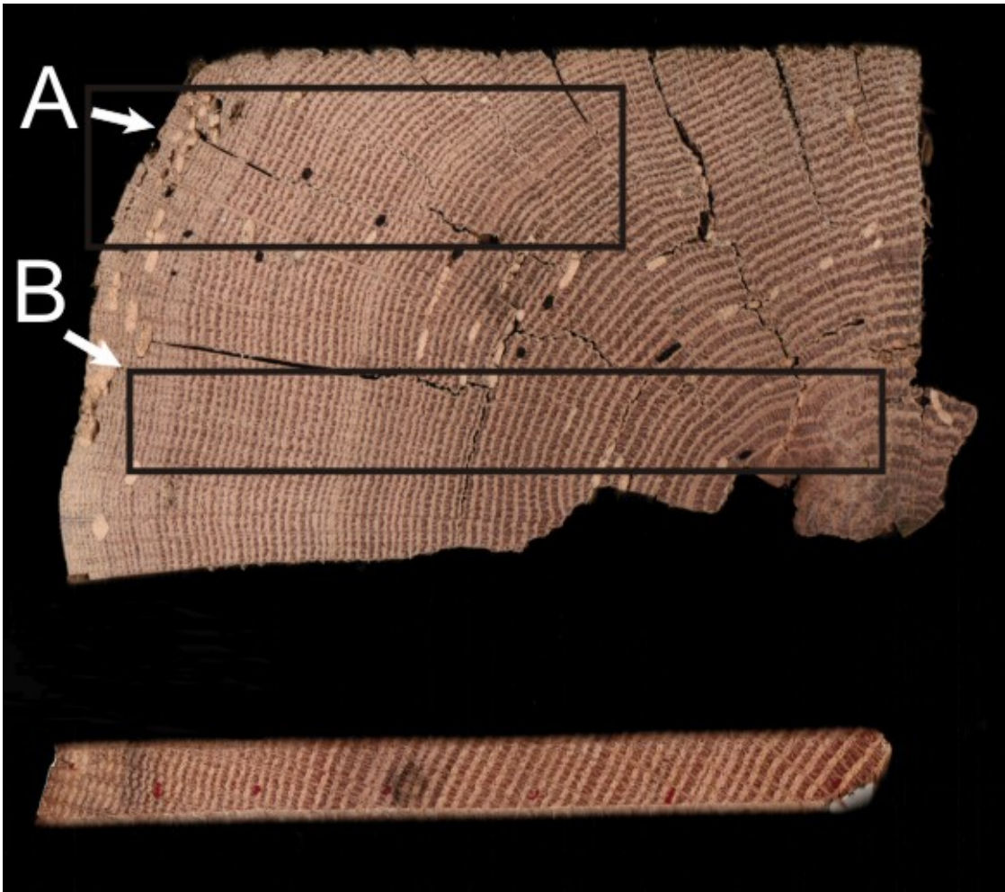
Figure 1. A cross-section of an oak timber with sapwood rings on the left-hand side (above). The boxes illustrate conversion methods resulting in A ) a precise felling date and B ) a terminus post quem or felled after date. Also pictured is a core showing complete sapwood (below).